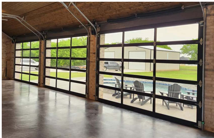
*CLR Low E Tempered IG Panel

Our ThermaView doors are third-party tested by a certified laboratory to strict National Fenestration Rating Council (NFRC) standards, achieving a 0.39* U-factor and 0.239 SHGC rating.